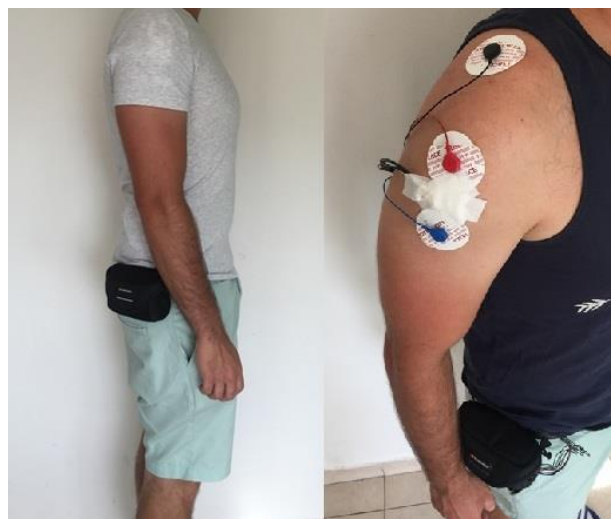
Figure 1, Second version of the device on a patient.

In 2016 Arduino Leonardo was substituted by Arduino Micro. Micro is smaller and even cheaper than Leonardo. The new board made the device lighter and it fitted better into the case. We also added surface EMG sensor for measuring muscle activity. Price of the second device was little bit higher than price of the first one, that was caused by the SEMG sensor. The price was around €130. Everything else stayed the same.