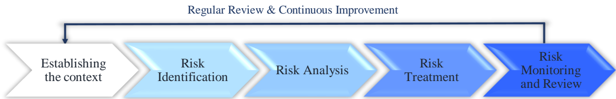
Fig. 1. Risk Management Process Framework.

risk mitigation tools, monitor, and control risk and create a homogenous system of risk management. [12] In a few words, risk management is not oriented toward the whole company, but an effective and efficient way that supports the implementation of developed strategy and reads those signals that indicate a need to modify assumptions, financial flows, programs and results. [4]