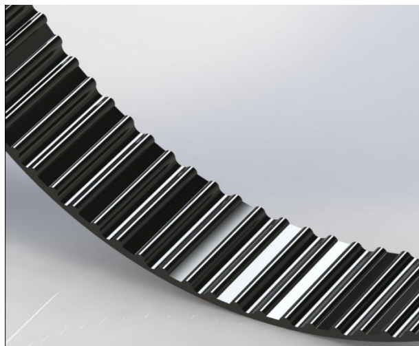
Picture 2. Corrugating plates.

expanding wedges, articulated locks, but bolts are commonly used. The screws, however, weaken the liner, which becomes more susceptible to impact. [2], [3]