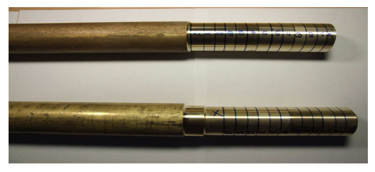
Fig. 2. Turning: material's test no. 74 and 70

When comparing the times for the individual materials is seen that shortest times are for samples No.2 and etalons. And the longest time was for a sample No.5.