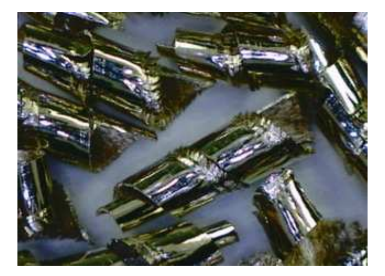
Fig. 4 Sample No. 7 – Material 74