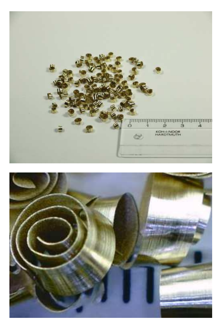
Fig.3 Sample No.24 - Material 70 chips and detail

The test principle: roughness measurements at five locations along the helix for each machined portion values were statistically processed and used to create charts.